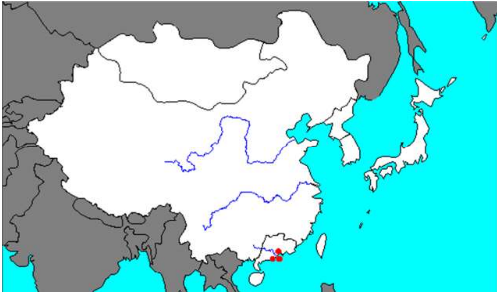
East Asia Map